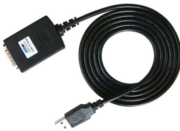
UE-RA15SC-B (USB2.0 转串口)