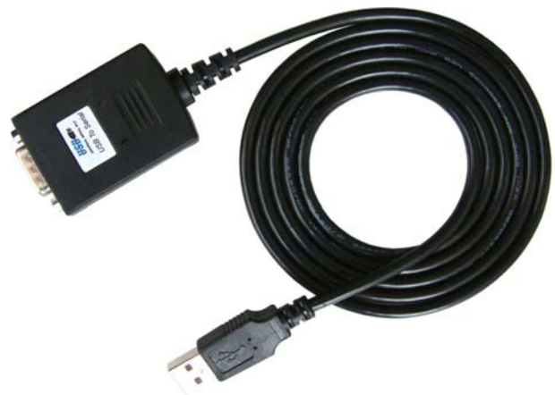
UE-RA15SC-B (USB2.0 to Serial)